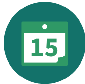
Time & Attendance